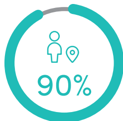
AAGROUP TOUR DIRECTORS