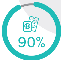
DOCUMENTATION AND COMMUNICATIONS