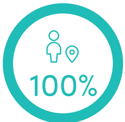
AAGROUP TOUR DIRECTORS